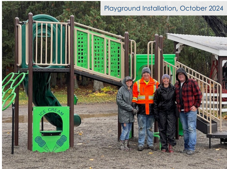
Playground Installation, October 2024

This fall, Mount Polley also welcomed public mine tours and school field trips, fostering community engagement and education. In November, a public meeting and tour were held, offering attendees the chance to ask questions and take a tour of the site. The small group size allowed for a more tailored experience, providing more time to address questions and areas of interest.