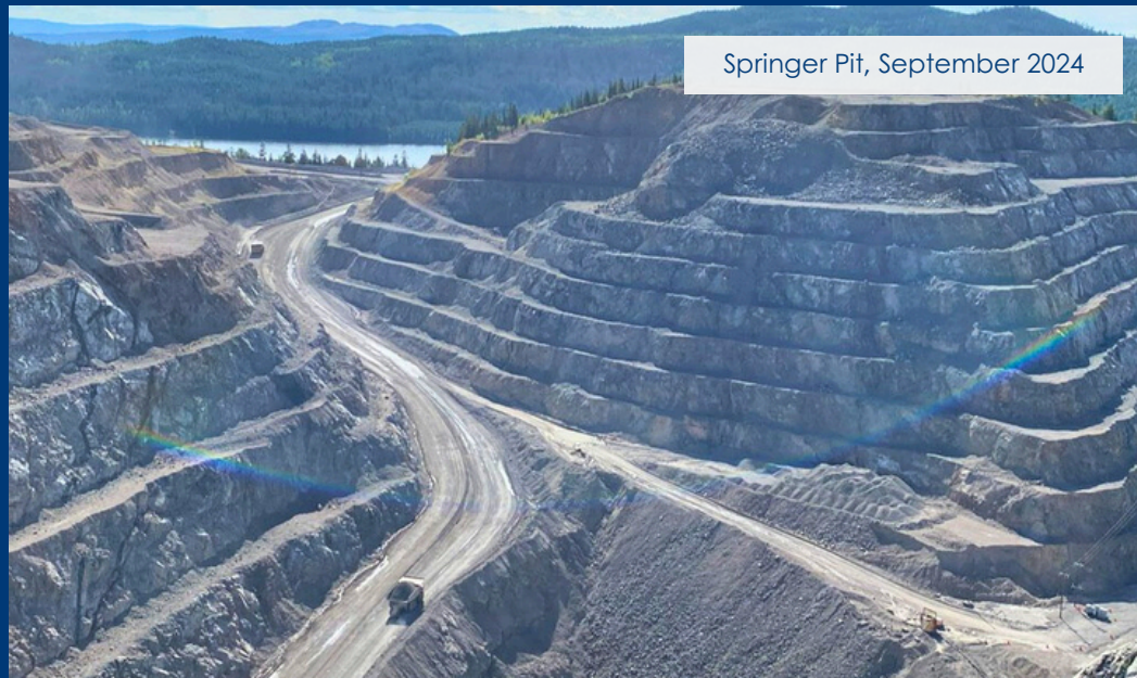
Springer Pit, September 2024

Looking ahead, our plans include conducting exploration to identify future mining opportunities. We will continue the phased development of the Springer Pit, and strategic infrastructure projects like raising the tailings storage facility.