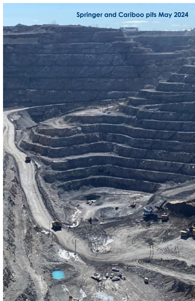
Springer and Cariboo pits May 2024