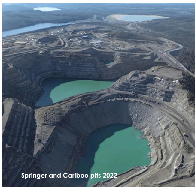
Springer and Cariboo pits 2022

In May, we reached a significant milestone by completing the last deliveries of tailings from the Springer pit to the Southeast Rock Disposal Site. Mount Polley utilized a method of storing tailings called Dry Stacking. This process involves storing tailings in a dry, compacted form in designated cells atop the rock storage area. This innovative method not only reduces the environmental footprint, but it also enhances the stability and safety of our tailings storage.