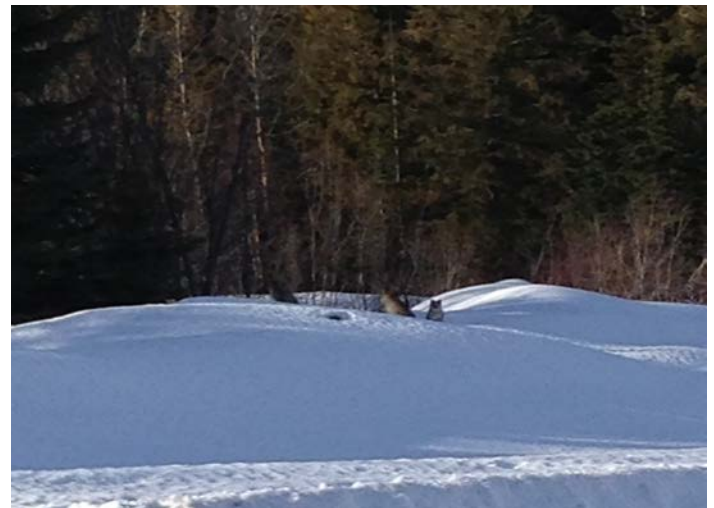
Figure 4. Lynx and her kittens by Polley Lake Rd, January 2016