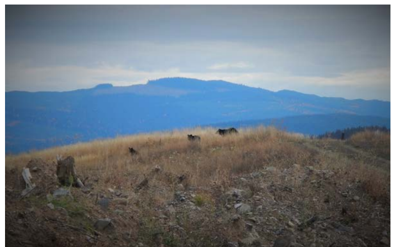
Figure 2. Three bears on North East Zone, October 2015.