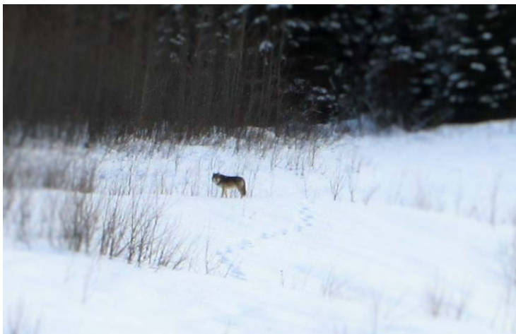
Figure 3. Lone wolf by the Gavin Lake Road, February 2016.