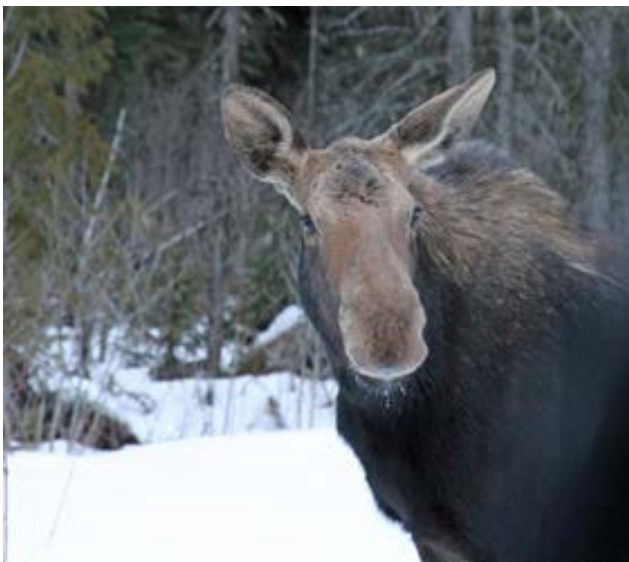
Figure 1. Moose at Polley Lake, March 2015.

In comparison to 2014, the amount of sightings in 2015 has nearly doubled due to the attentive employees recording their observations and the noticeable presence of wildlife around the site.