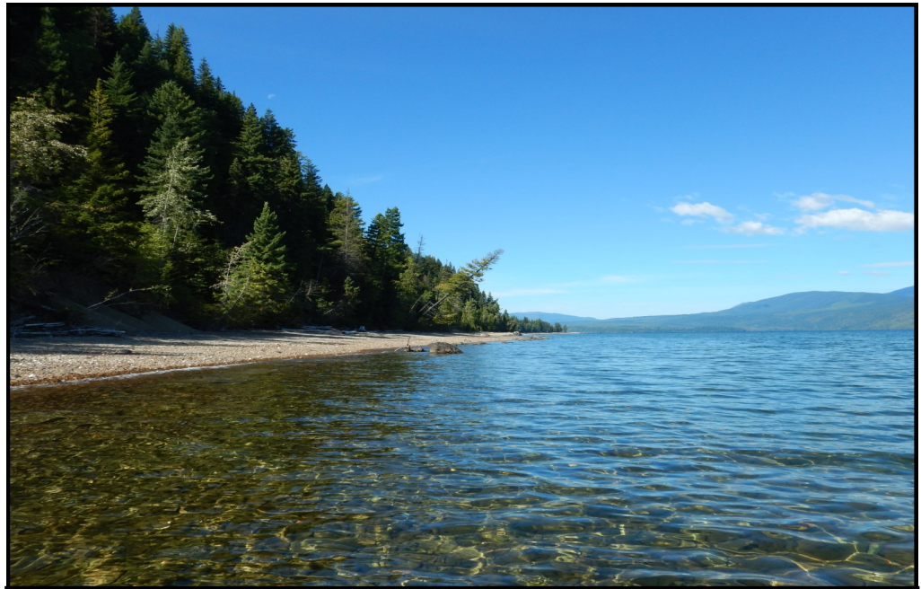
Quesnel Lake and shoreline August 2016