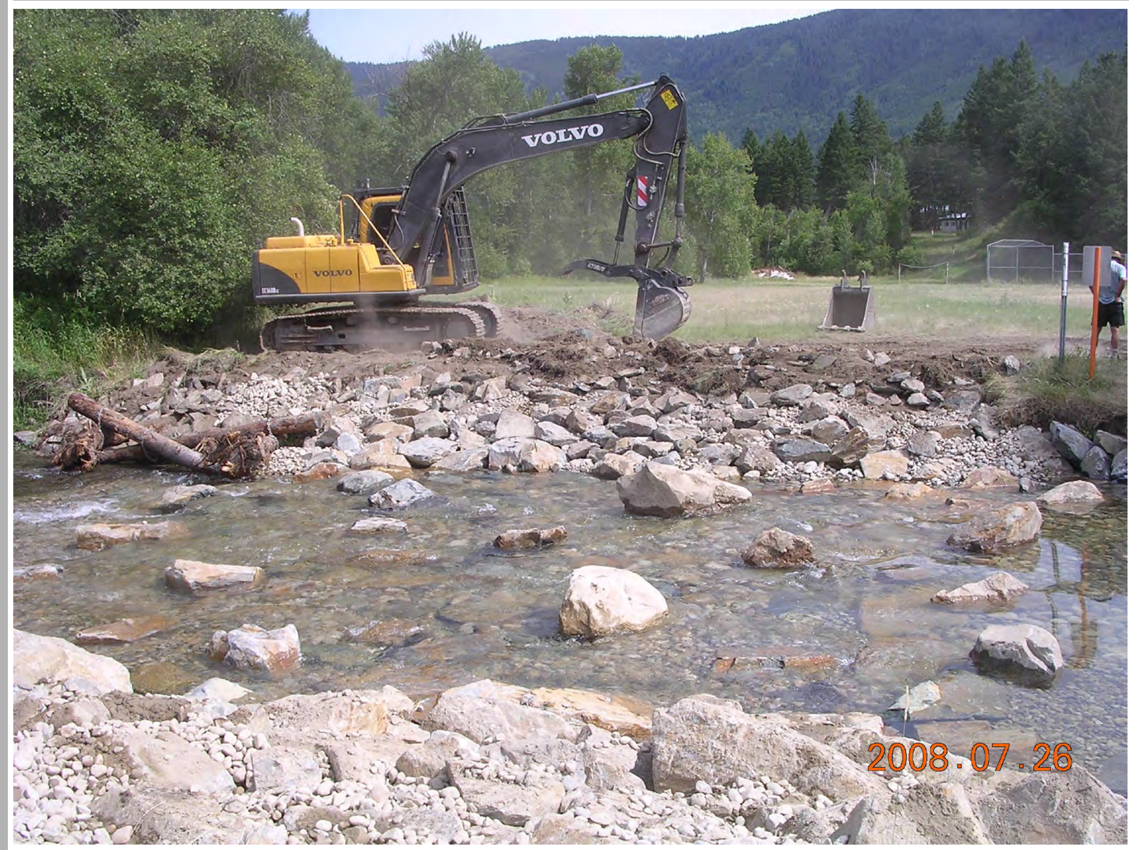
Stream Bank Stabilization