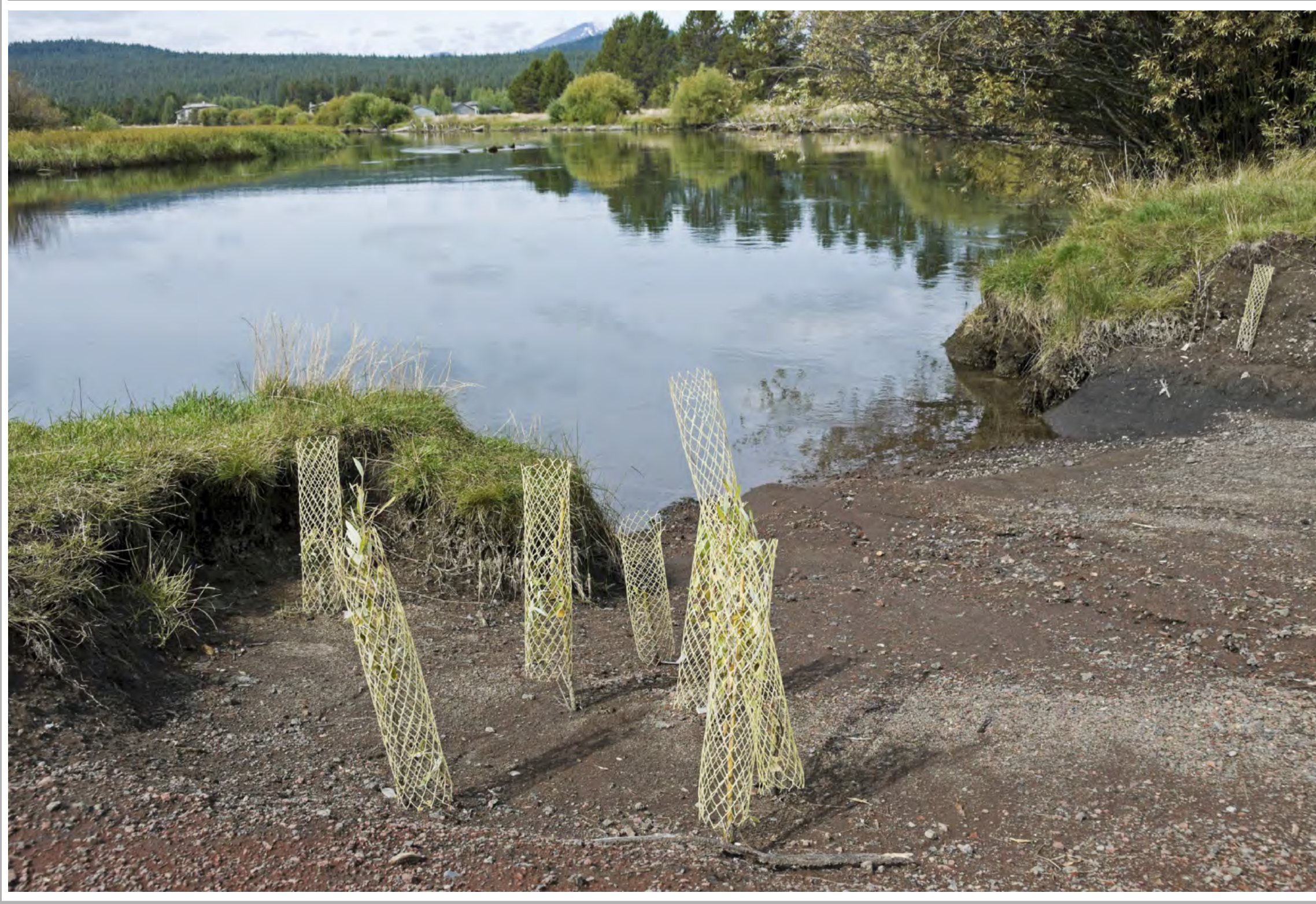
Riparian Habitat Reclamation