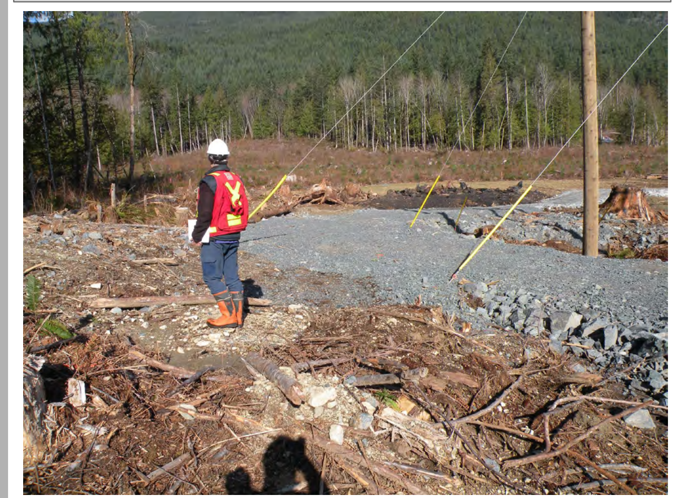
Temporary Access Road