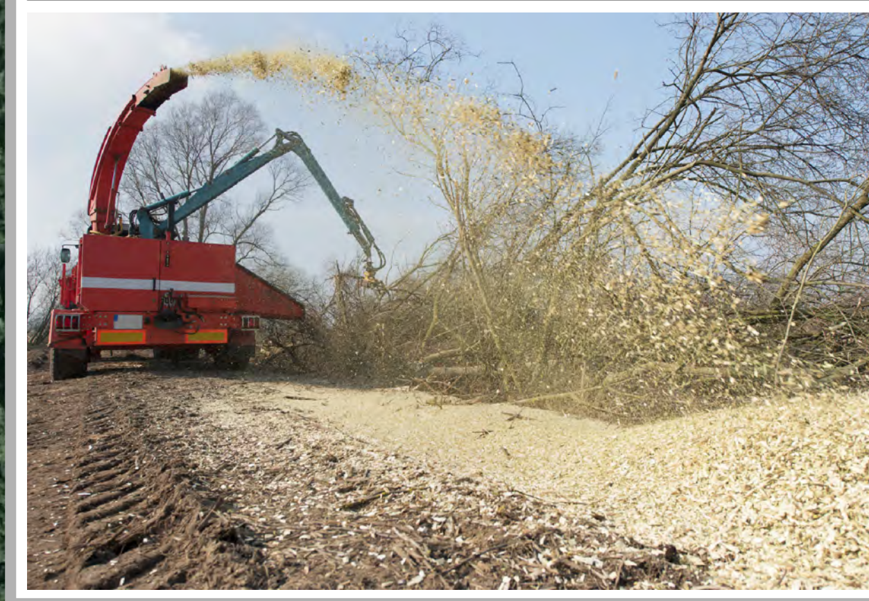
Recovery and Mulching