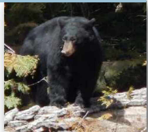
Black bear sighted on site, April 2019

Please visit the Imperial Metals website for more information about MPMC's reports and ongoing projects: https://www.imperialmetals.com/our-operations/mount-polley-mine/mount-polley-updates