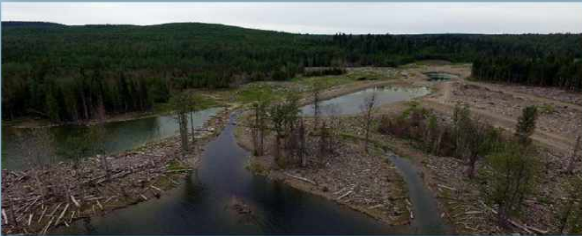
Edney Creek Delta, August 2017