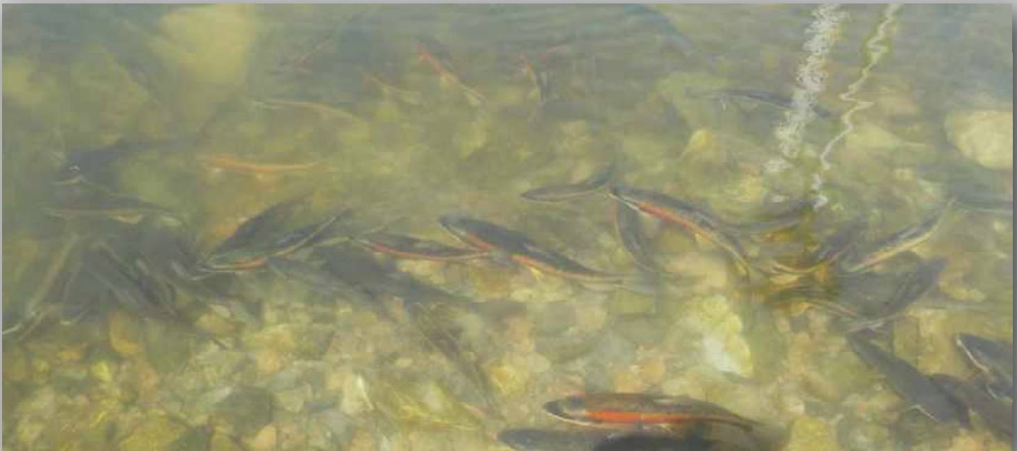
Spawning fish in remediated area of upper Hazeltine Creek (Reach 1), May 2019

There are no changes planned to the mine's environmental monitoring program while the mine is on care and maintenance.