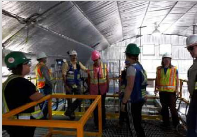
Tour group with additional MPMC environmental field staff explaining the different components of the WTP on top of the cells at the plant.

There was not enough time to visit the 5 th stop, the Constructed Wetlands Treatment System (CWTS) pilot project, part of the mine’s passive water treatment on-site research. This was postponed for another tour in Q3 or Q4.